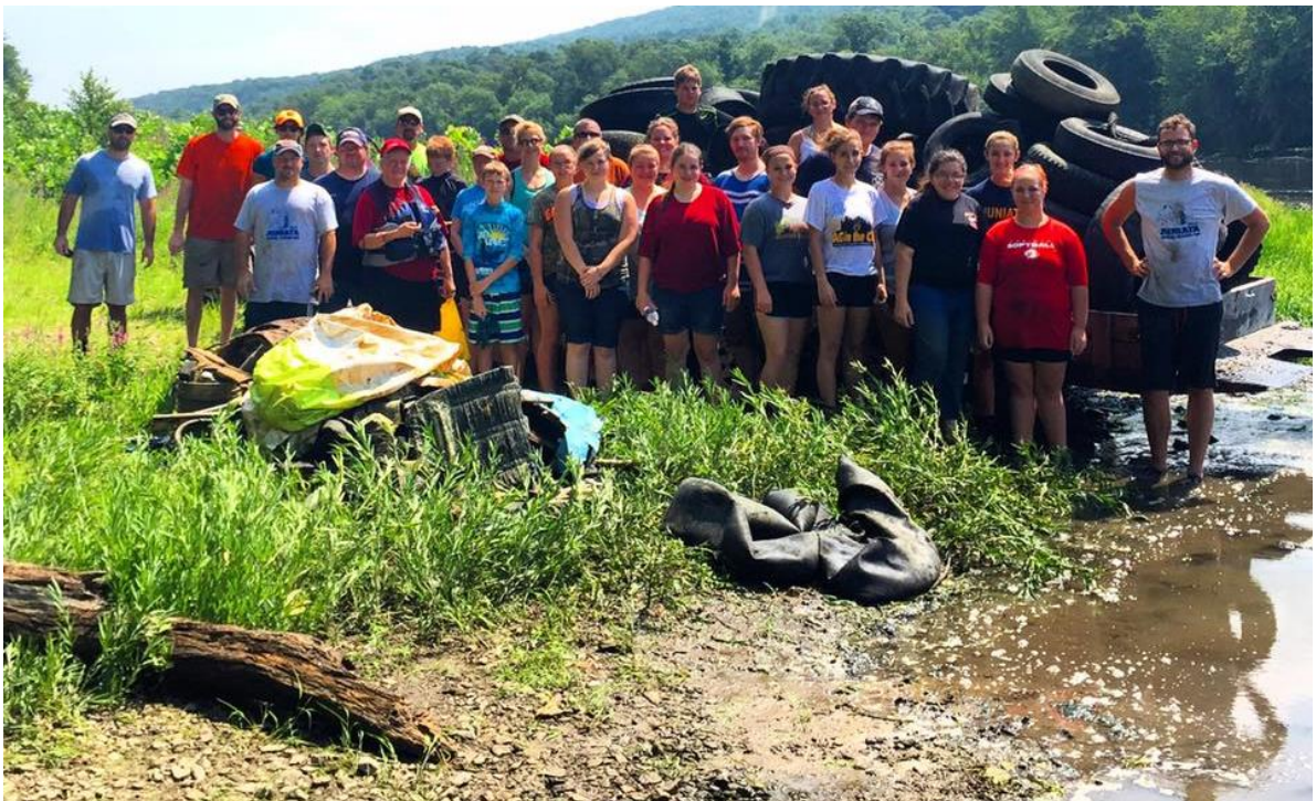
Keep Juniata County Beautiful volunteers clean a section of the Juniata Rive.

By being aware of these tasks ahead of time, your team will have time to plan and address them. Many waterway cleanups have been conducted over the years by dedicated individuals and groups ready to make a positive difference for their environment.