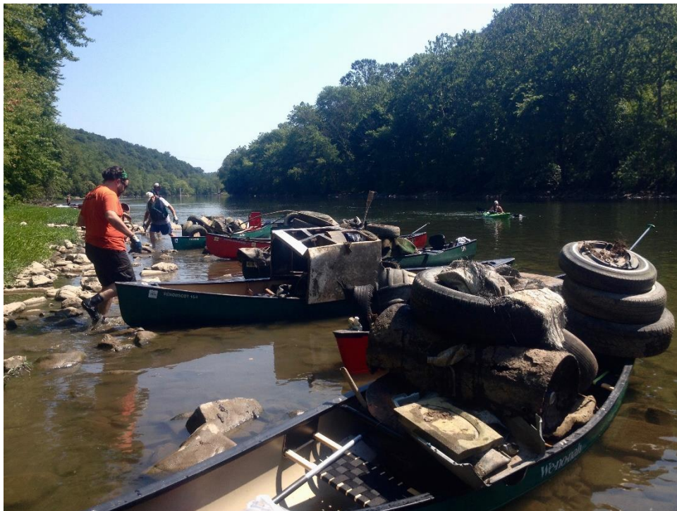
Keep Juniata County Beautiful volunteers clean a section of the Juniata River.