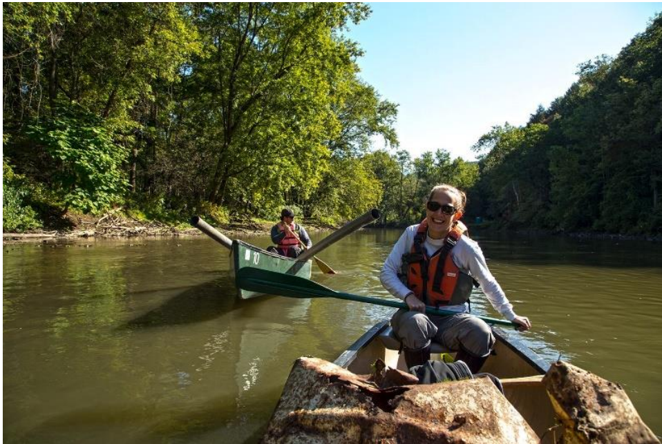
Allegheny River cleanup volunteers.

When defining your cleanup boundaries, keep in mind that the volunteers should not work more than three or four hours. While some may have the strength, stamina and desire to spend a whole day cleaning a stream, the majority will not. You want the volunteers to always be alert. A 9 a.m. start with lunch at noon works well.