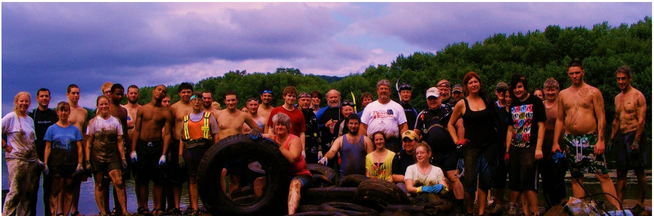
Clinton County CleanScapes volunteers after a cleanup of the West Branch Susquehanna River.

At the end of your cleanup, everyone will be glad they decided to be part of the solution. They'll feel great about the job they've done and they'll probably be surprised at the amount of trash they've removed.