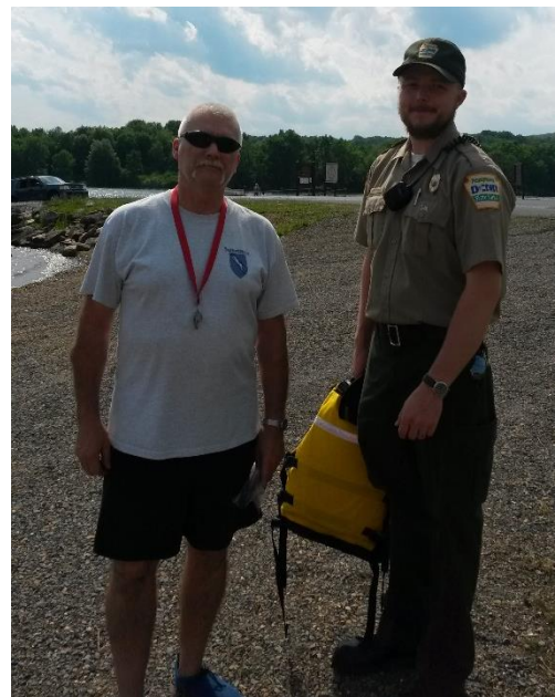
Volunteers and partners work together on waterway cleanups.