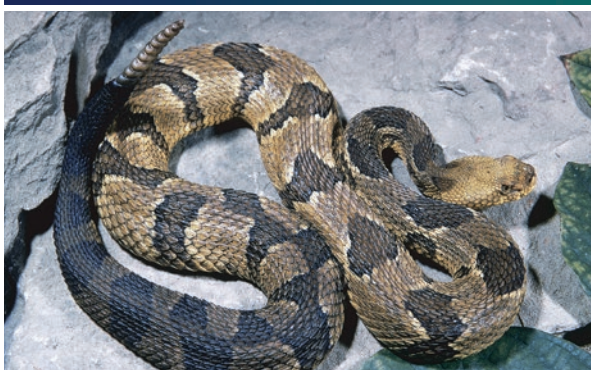
Timber Rattlesnake Crotalus horridus