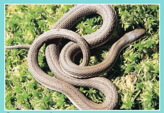
Queensnake Regina septemvittata