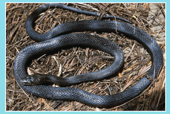
Eastern Ratsnake Pantherophis alleghaniensis