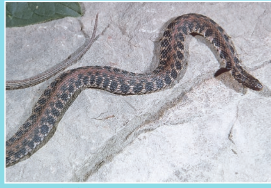
Kirtland's Snake Clonophis kirtlandii