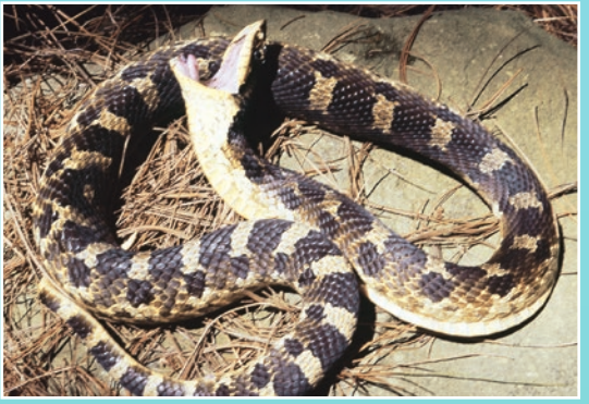
Eastern Hog-nosed Snake Heterodon platirhinos