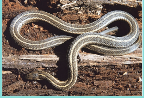
Short-headed Gartersnake Thamnophis brachystoma