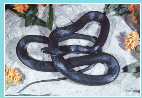
Northern Black Racer Coluber constrictor constrictor