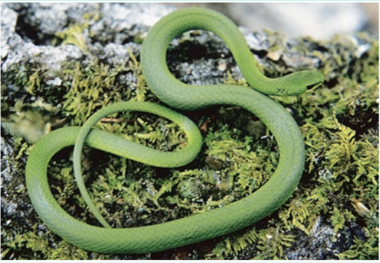
Smooth Greensnake Opheodrys vernalis