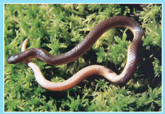
Eastern Wormsnake Carphophis amoenus amoenus