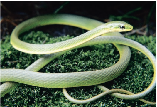
Northern Rough Greensnake Opheodrys aestivus aestivus