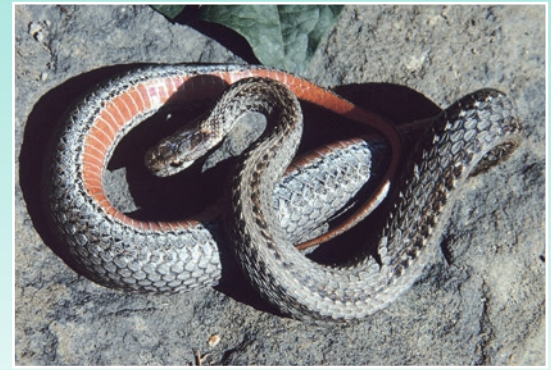
Red-bellied Snake Storeria occipitomaculata