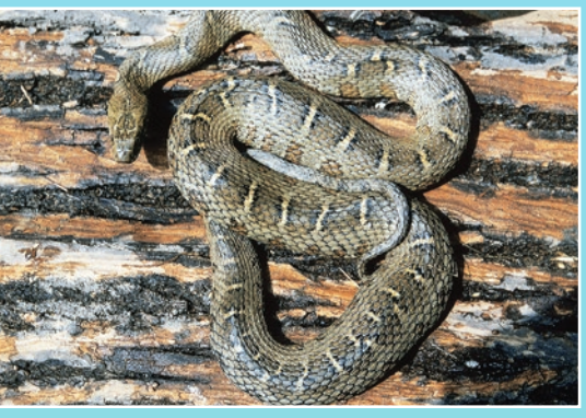
Northern Watersnake Nerodia sipedon