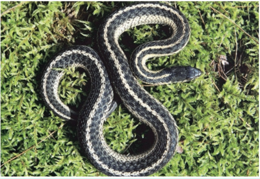
Eastern Gartersnake Thamnophis sirtalis sirtalis