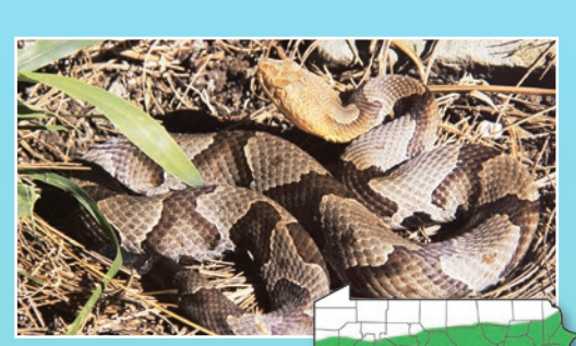
Eastern Copperhead Agkistrodon contortrix