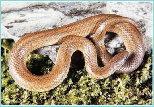
Eastern Smooth Earthsnake Virginia valeriae valeriae