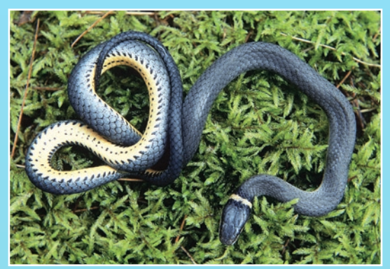
Northern Ring-necked Snake Diadophis punctatus edwardsii