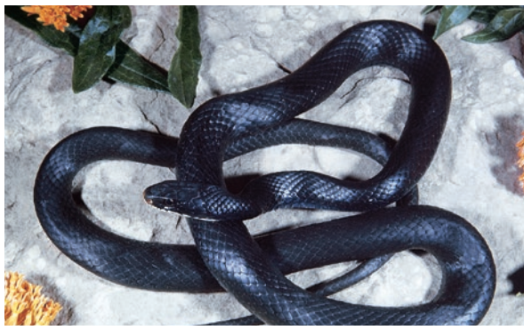
Northern Black Racer Coluber constrictor constrictor

Few other animals evoke such polarized emotions as fear, admiration, intrigue and ignorance as snakes. Throughout history, snakes have played integral roles in mythology and folklore. Snakes have often been characterized as evil or sinister. On the contrary, snakes do not possess such human characteristics. A snake's mission in life is to eat, grow and reproduce. More people are beginning to realize that snakes are an important part of the animal kingdom and